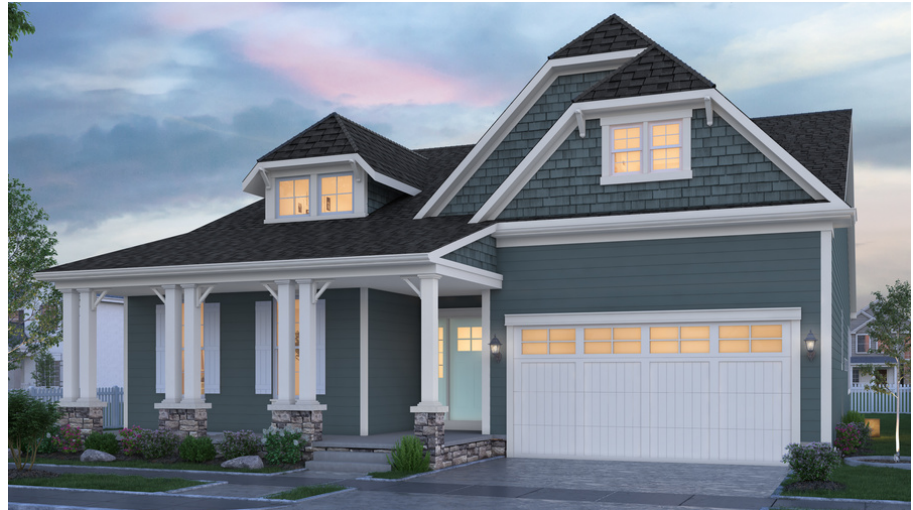
ELEVATION 3 (Shown with optional front porch and stone)