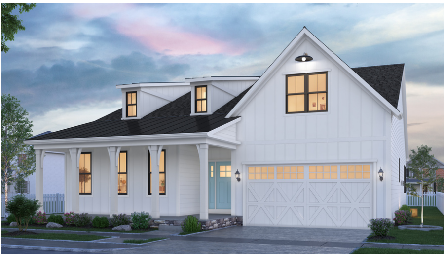
ELEVATION 5 (Shown with optional front porch, stone and black windows)

Approx. 2,267 - 3,396 sq. ft. 3 - 4 Bedrooms, 2.5 - 3.5 Bathrooms with a 2-Car Garage