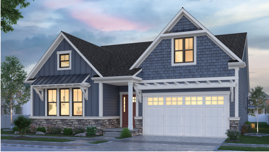
ELEVATION 2 (Shown with optional stone and black windows)